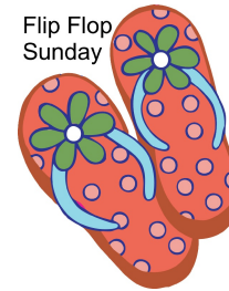
Flip Flop Sunday

LifeLines will resume after Labor Day, on Sept. 11 th ! Join us each Monday in the Seekers Class, 5:30-6:30p. Our LifeLine verse for 9/11 will be Colossians 1:27. Scripture is our LifeLine!